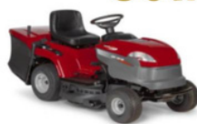
Castelgarden XDC150HD Tractor Mower 15hp Engine 32" Cut Hydrostatic Drive Retail Price €3200