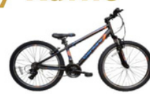
Bentini Phoenix Mountain Bike 27.5" Wheel GENTS Bike Retail Price €430